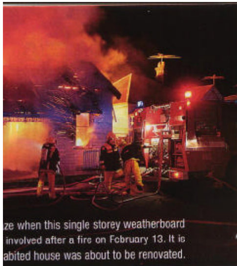
ze when this single storey weatherboard involved after a fire on February 13. It is abited house was about to be renovated.